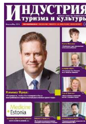
▶ KIMMO YARVA Mayor of Lappeenranta, Finland