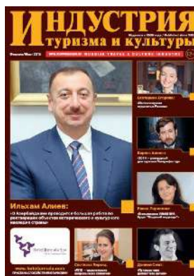
▶ ILHAM ALIYEV President of Azerbaijan