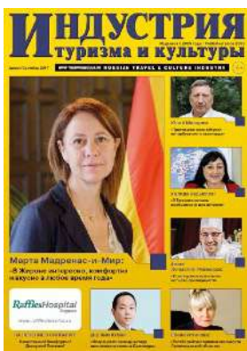
▶ MARTA MADRENAS Mayor of Girona, Spain & Member of the Parliament of Catalonia